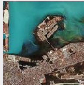
State & Local Government

All of BNL Tech's services are delivered as custom tailored solutions, and our geospatial solutions will match your project needs and your budget.