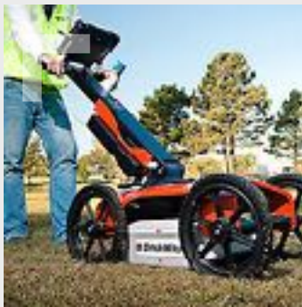
Scanning & Surveying

Our suite of geospatial solutions offers great value for many applications. In some cases it is the key deliverable, leading to topographic maps, planimetric maps, orthophotography and high resolution video, and in other cases it supplements project development and management efforts. BNL Tech provides both aerial and ground-based solutions. These platforms allow for unparalleled flexibility and responsiveness to meet our clients' needs.