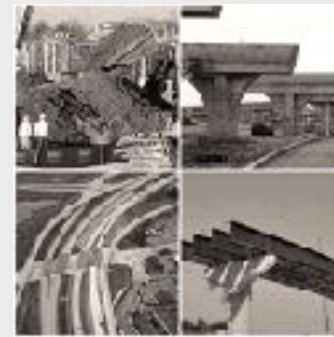
Site Documentation & Monitoring

Dunn & Bradstreet (DUNS): No. 06-944-1850